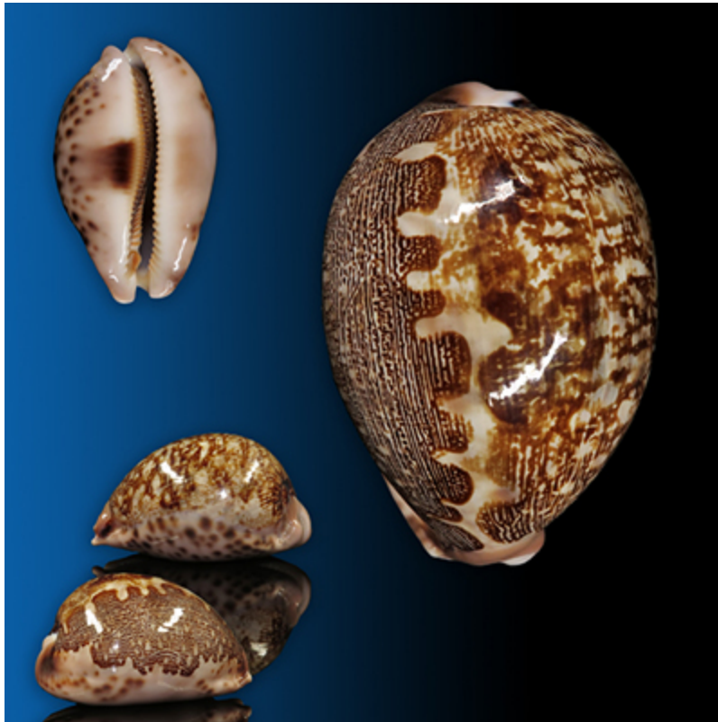
Leporicypraea mappa mappa SPECIAL COLOR

The first time in 25 years and having handled 840 mappa , that we have a specimen in which the left and right half have different patterns, separated by a beautiful central dorsal line. SPECTACULAR is indeed the proper terminology. From Talibon, Bohol. This unique specimen raised 604 euro.