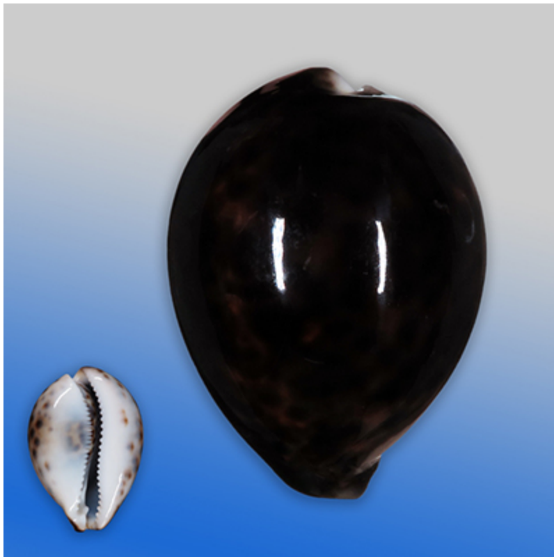
Cypraea tigris pardalis BLACK

The first time in 25 years and having handled 840 mappa , that we have a specimen in which the left and right half have different patterns, separated by a beautiful central dorsal line. SPECTACULAR is indeed the proper terminology. From Talibon, Bohol. This unique specimen raised 604 euro.