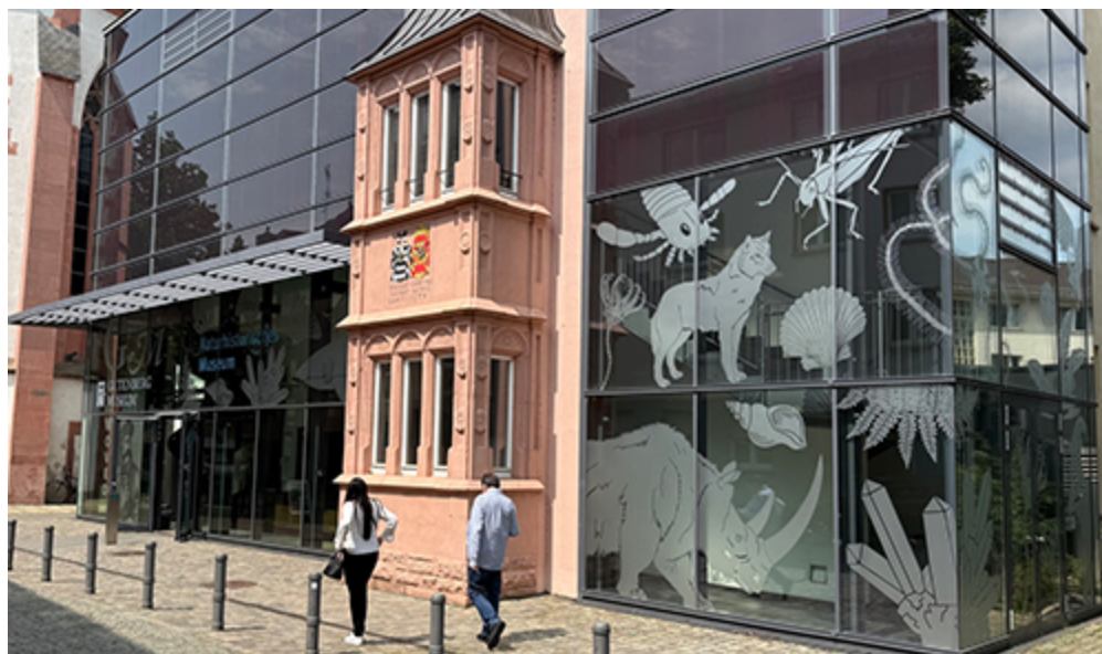
The Museum, seen from outside, well decorated with shells and some sorts of animals...