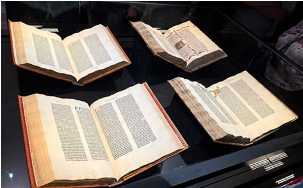
Of huge size, here Gutenberg bibles, exhibited in the Mainz museum.